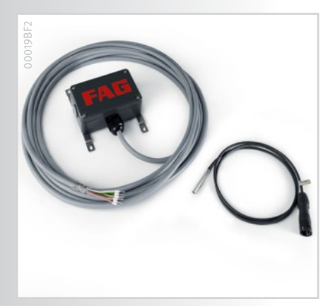
Electronic evaluation system and grease sensor