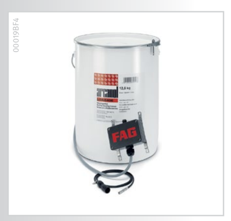
Can be used for FAG Arcanol greases and other greases after calibration

For further information on FAG condition monitoring products just ask for a copy of our catalogue!